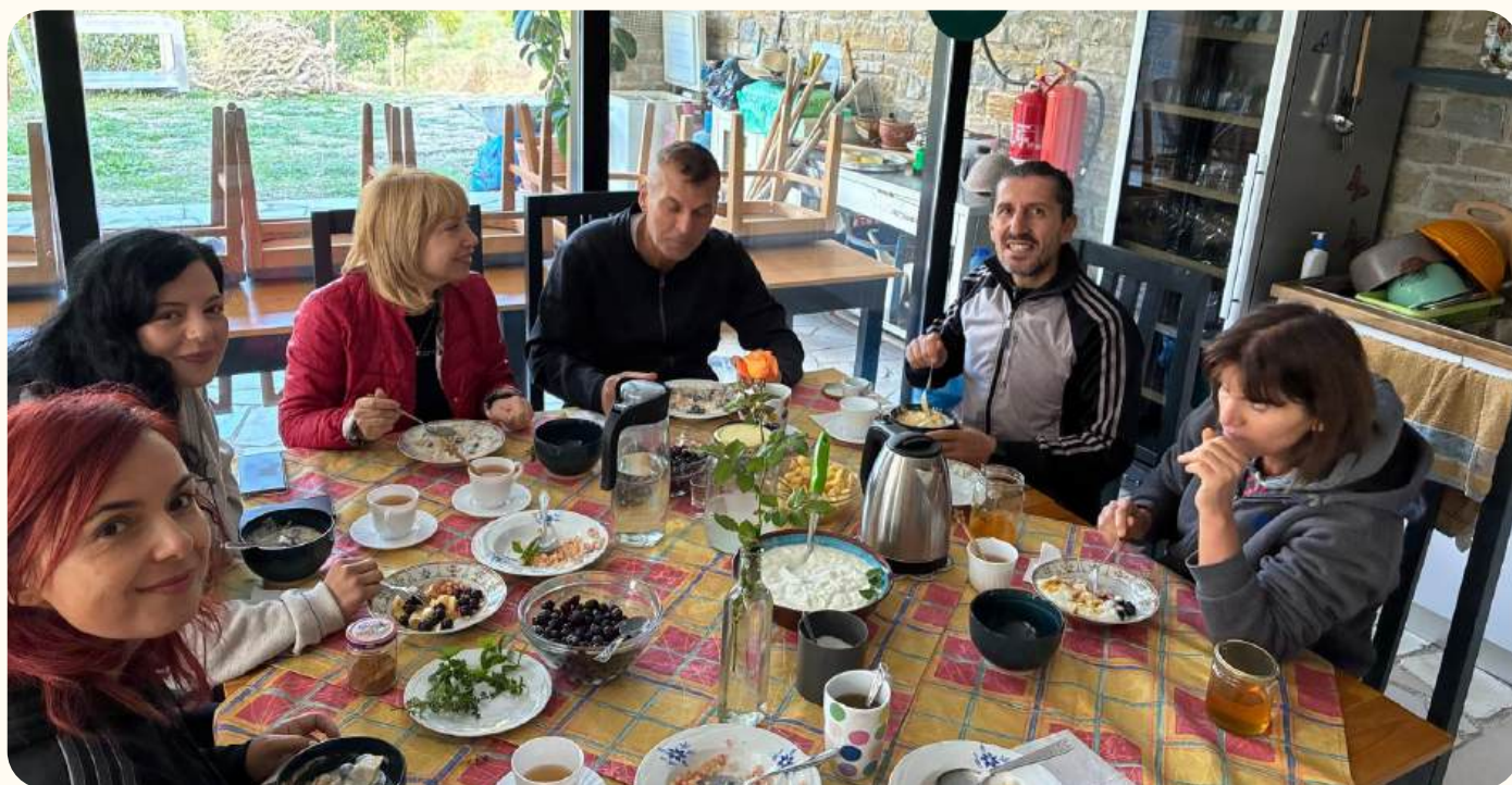
Sharing a lovely brunch on the Sunday