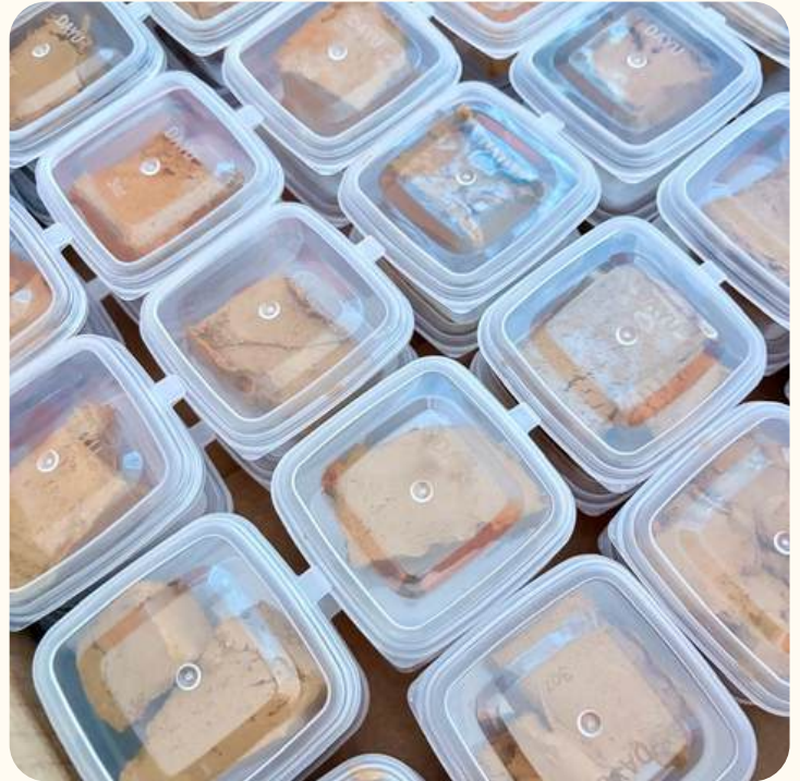
Here are some of the mud packs individually handed out.