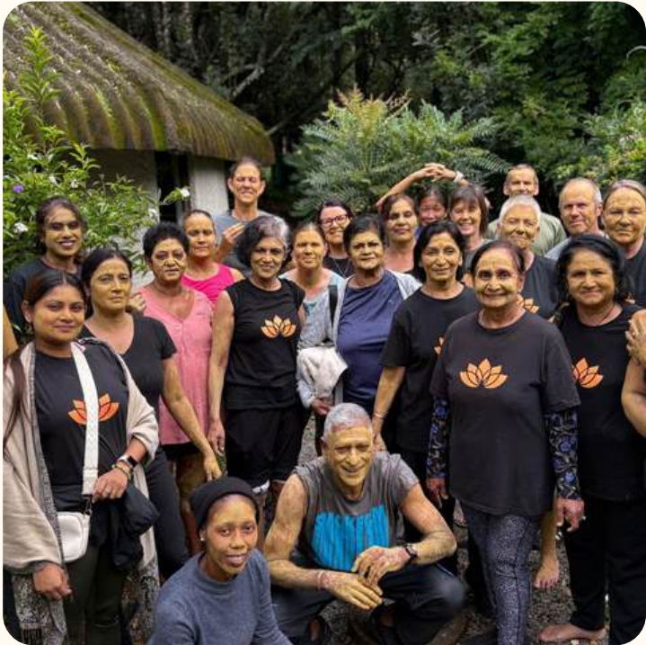
They are all applying mud packs, which you can see on their faces and arms.