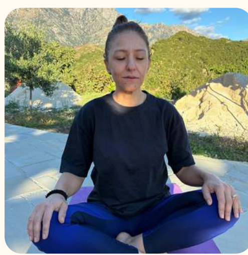
Neem mask and meditation in beautiful surroundings